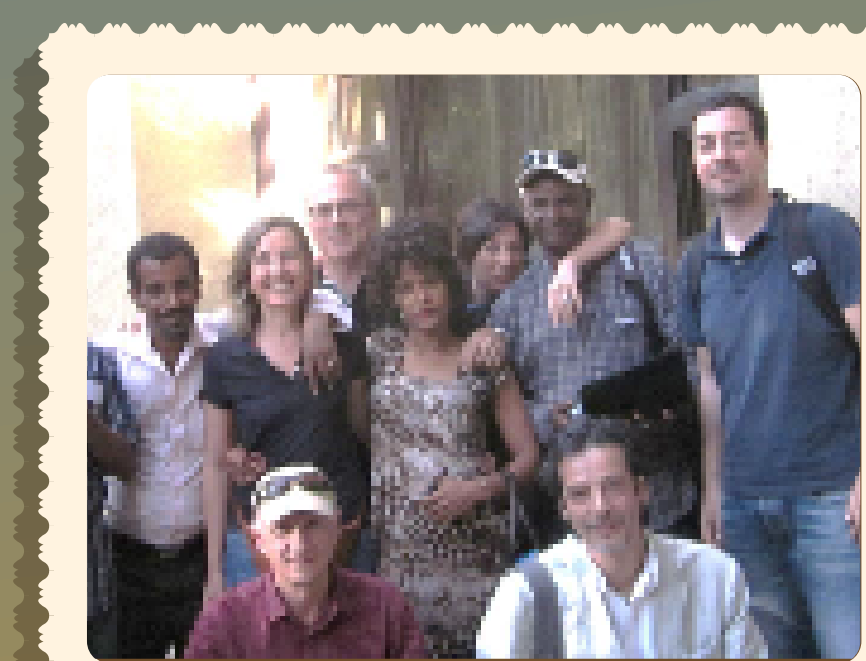
CASA project team in Mekelle in May 2014