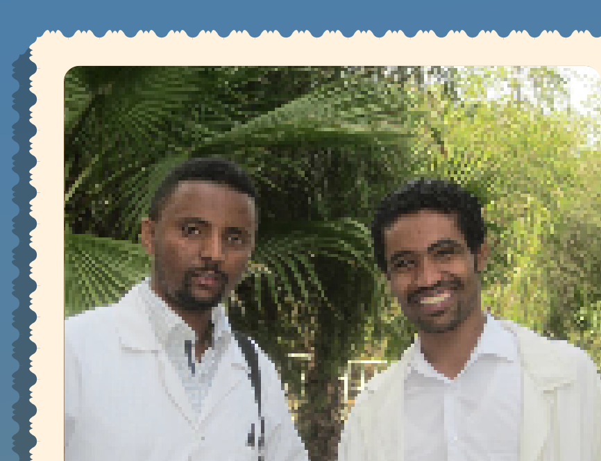
Doctors at Mekelle