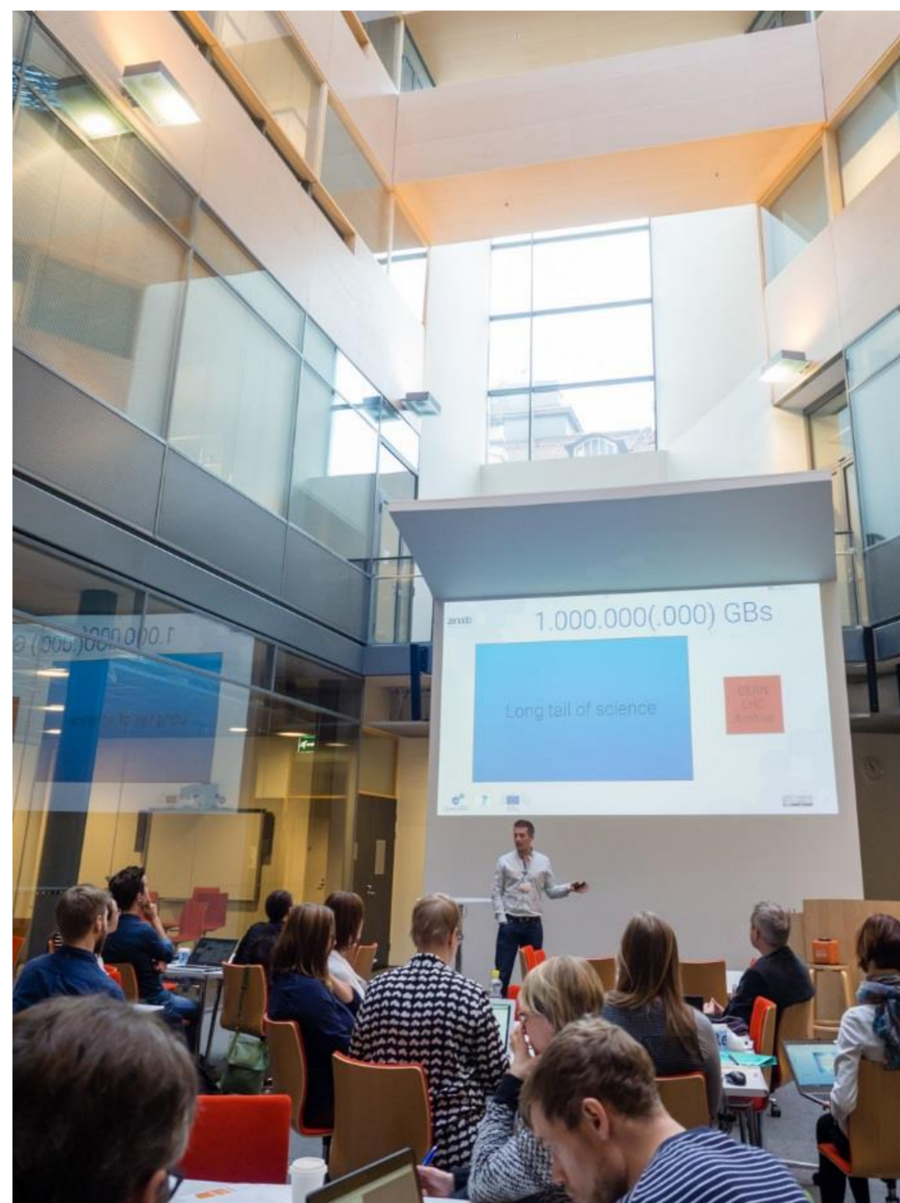
Open Science Workshop 20.10.2015