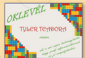
Figure IX. Certificate