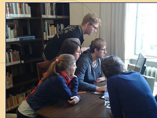
Figure V. Teamwork

It is a game which may be played from any browser. The story was created with Twine. Twine is an open-source tool for telling interactive, nonlinear stories.