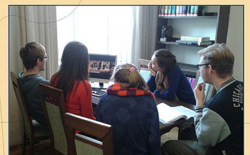
Figure VII. Exam