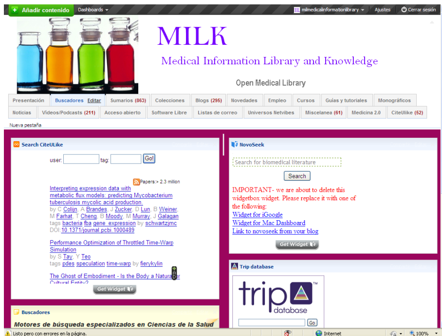
Fig. 7 Widget Search CiteULike at MILK

The RSS channels that we can create and add to Netvibes, may be labels of both magazines received at our centers, and materials to facilitate the development a thematic library with an immediate warning system, cooperative and sustainable.