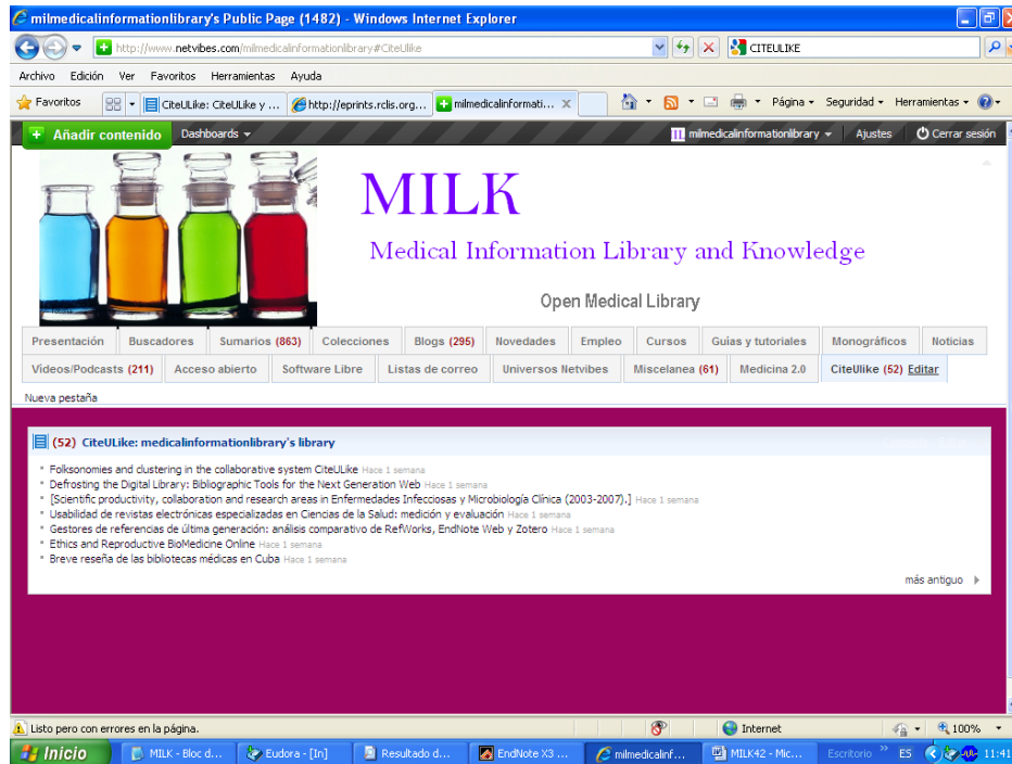
Fig. 8 RSS CiteULike at MILK