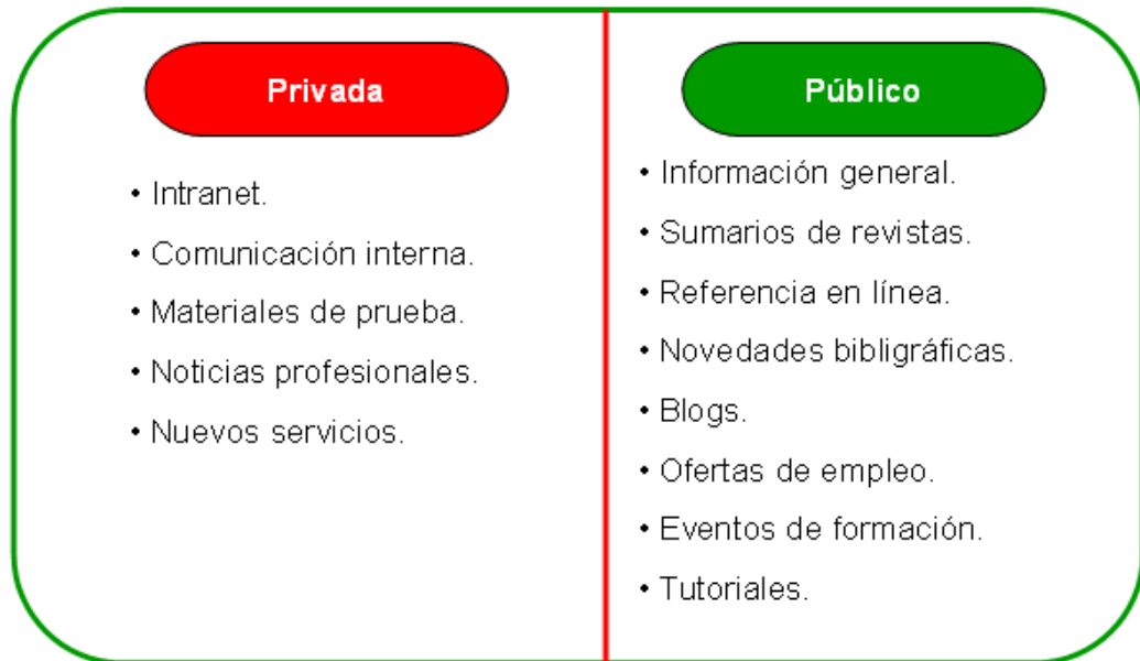
Fig. 1 Public and private profile Netvibes

it differs from it and from other applications and have a public part and a private part. The public one provides the information visible to users, and the private one works as an intranet, ie as a workspace and communication between members of the community of participants